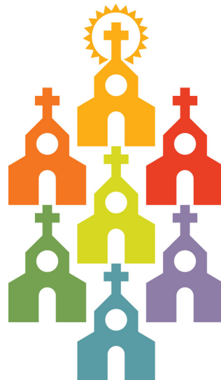
Answer: B (See See Revelation 2-3.)