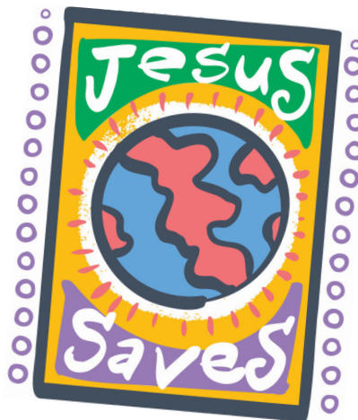
Answer: A (See John 12:47, NIV.)